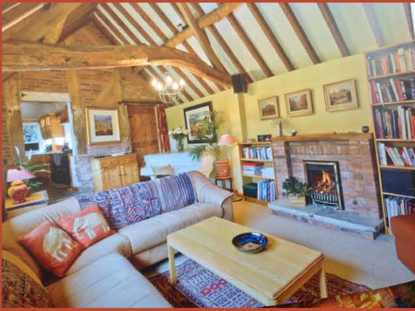
Photo of previous home in England